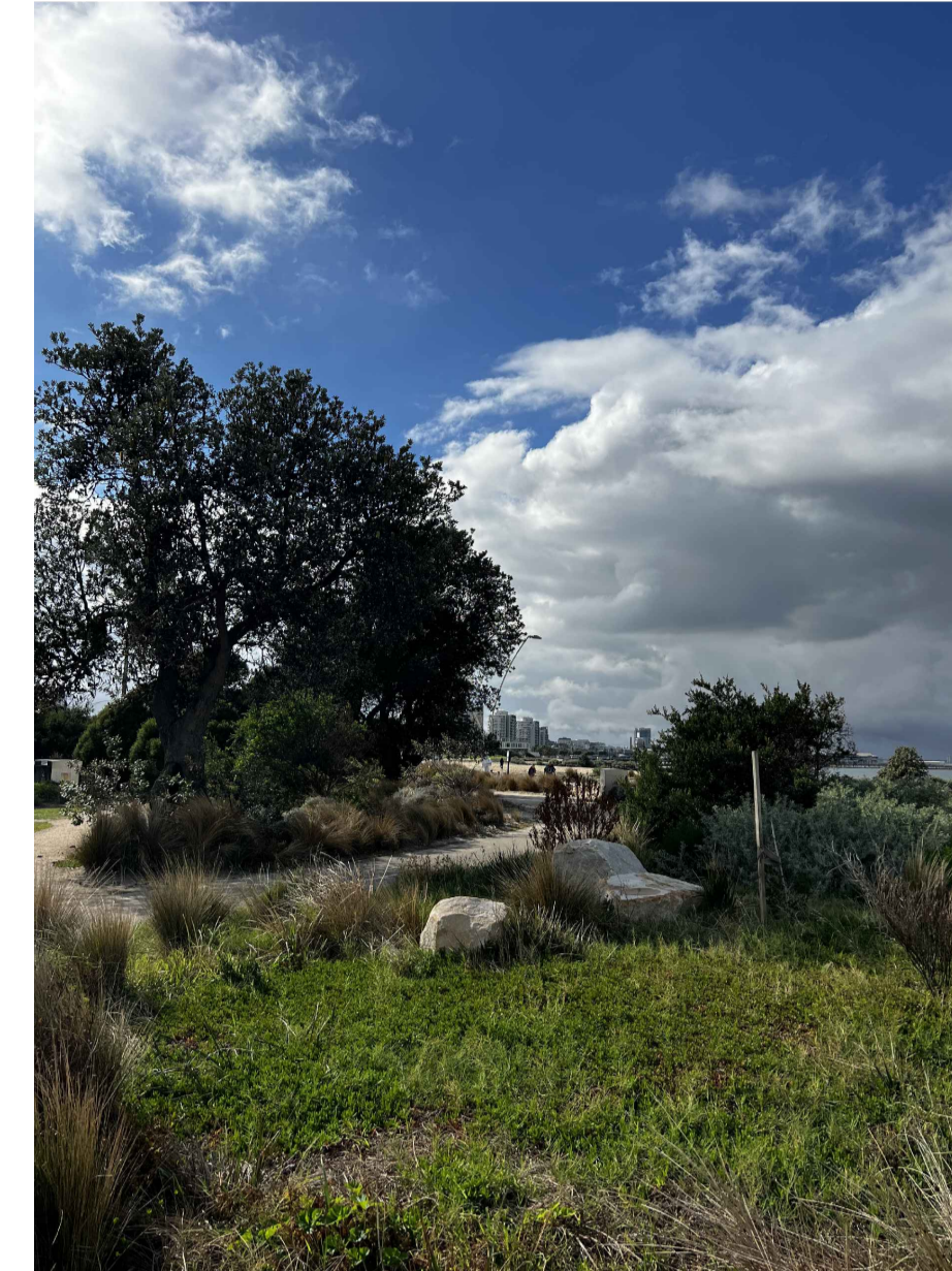
Example of biodiverse understorey planting at Sandridge Beach