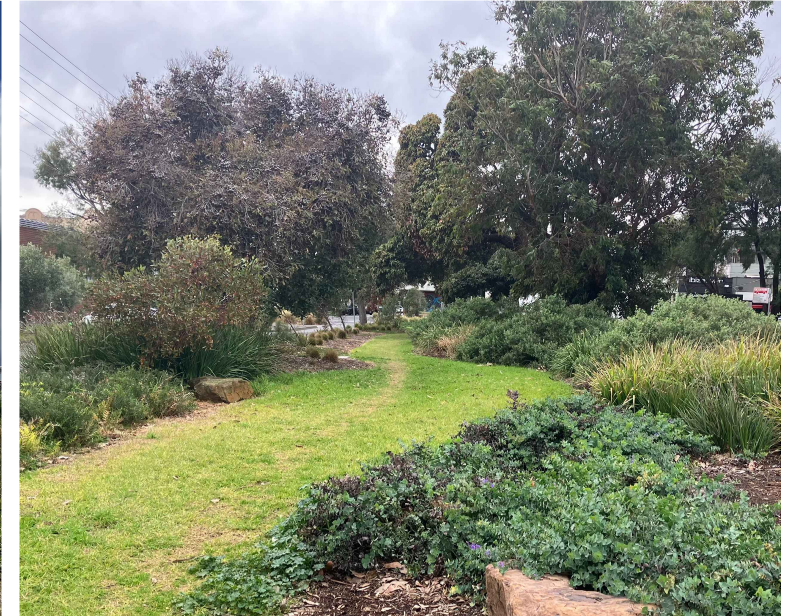
Example of biodiverse understorey planting at Danks Street Biolink