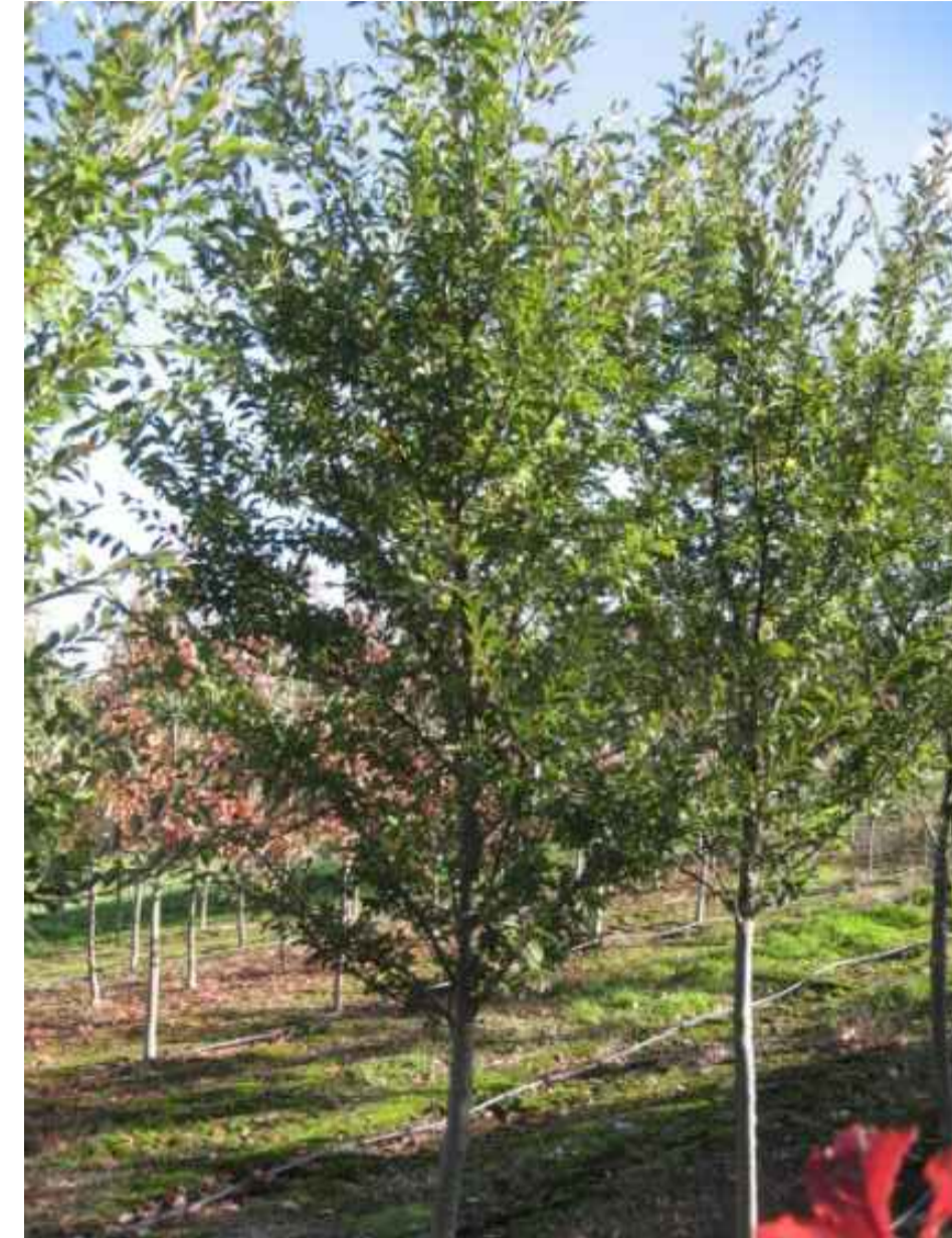
Ulmus parvifolia 'Burnley Select