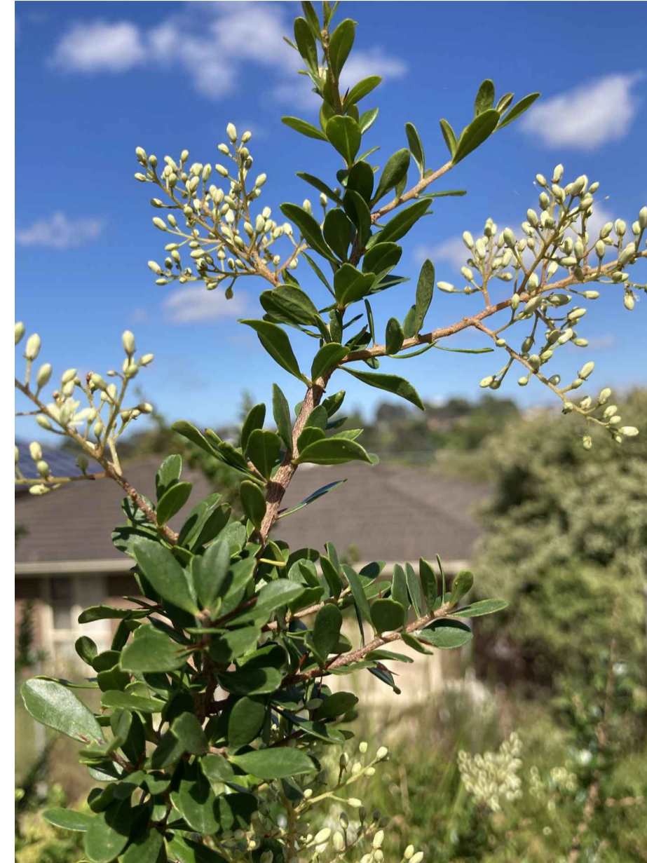
Bursaria spinosa , an example of one of the trees in the "Seed to Success Council Trialling Program"