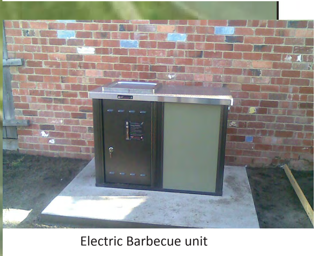
Electric Barbecue unit