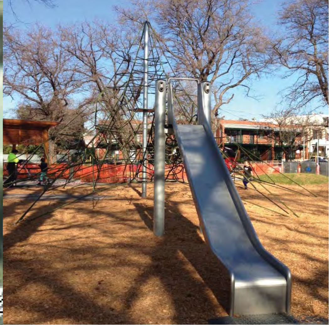
Climbing Net with Slide