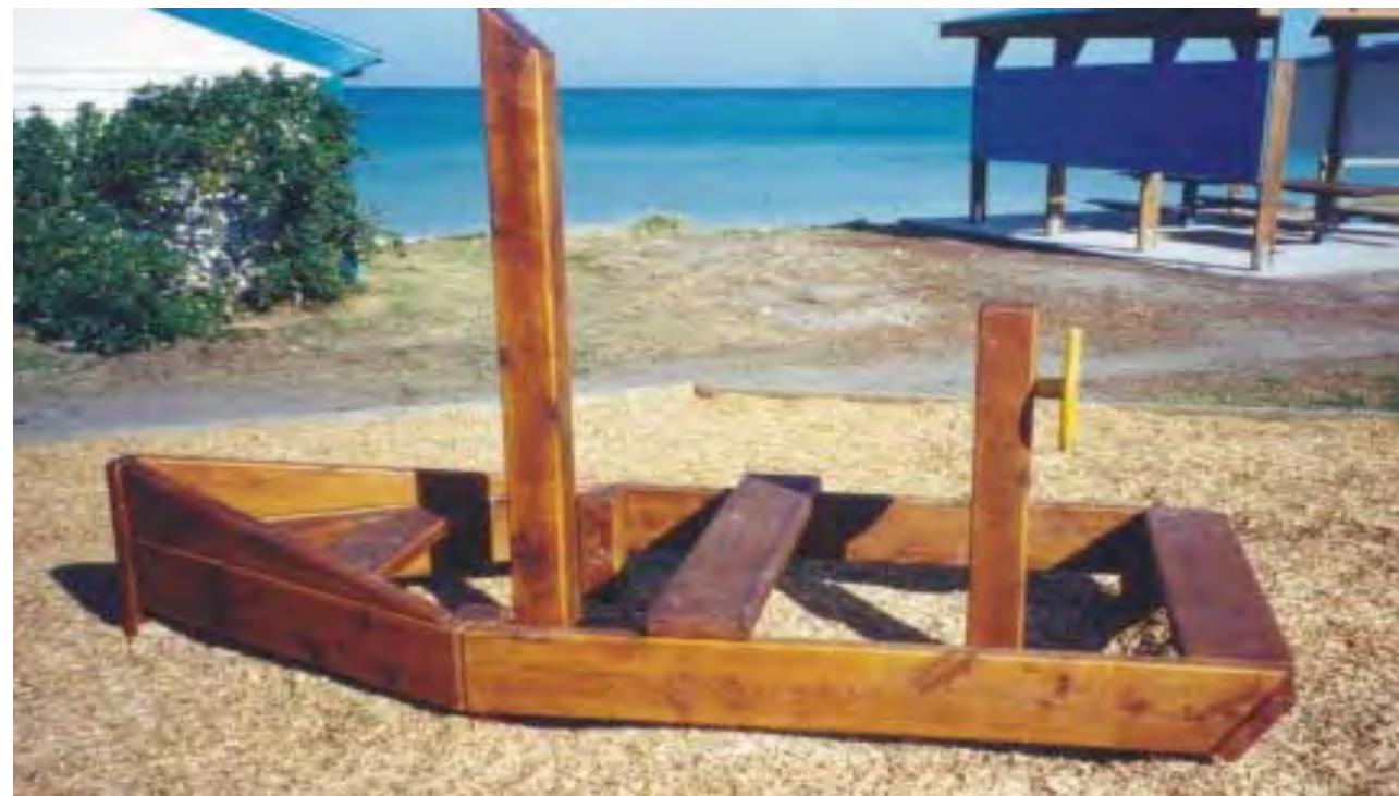
Timber Play Boat