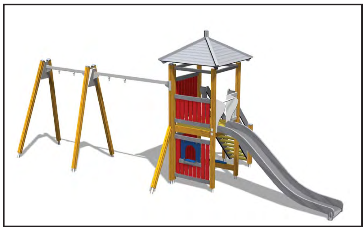
Junior-aged Slide tower with shop counter and 2 x toddler swings