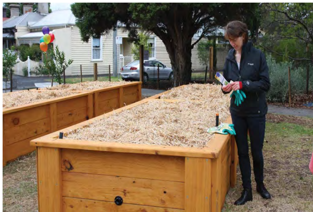
Community Veggie Beds (pictured here at Lyell-Iffla Reserve South Melbourne)