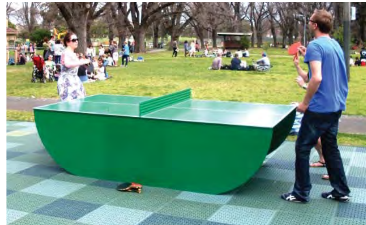
Steel Ping-Pong Table