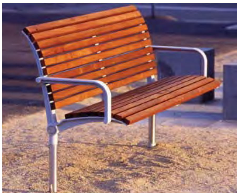
New timber seats x 3